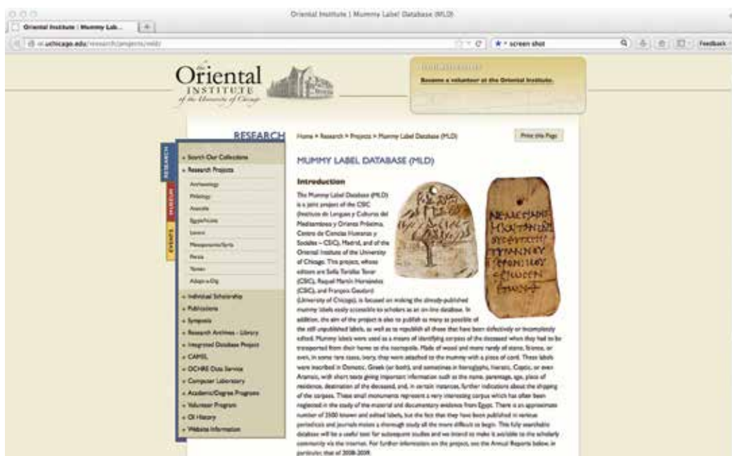
Figure 2. The homepage of the Oriental Institute website dedicated to the Mummy Label Database

As for the Oriental Institute MLD webpage, it includes a description of the project as well as downloadable PDF documents of all the MLD annual reports since 2008–2009. Both websites and the database will be updated on an ongoing basis. Moreover, our aim is to have a preliminary version of the database, with approximately five hundred items, uploaded by the end of October 2013.