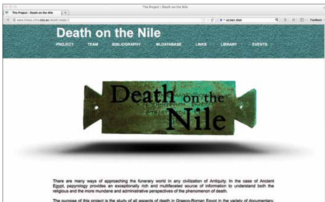
Figure 1. The homepage of the CSIC website dedicated to the project Death on the Nile, hosting the Mummy Label Database

http://oi.uchicago.edu/research/projects/mld/