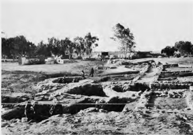
View of area H looking south with the Hijaz gate (on the left) and the Abbasid street.

This season at Aqaba, Jordan, began with the installation of a permanent museum, reported in News & Notes 122 by James Richerson. As he explained in that article, these were well-traveled objects, having been brought to Chicago, then taken back to Amman, shown in Irbid, and now returned to Aqaba. In conjunction with the Aqaba museum, Jim designed a series of signs, which are now distributed around the site and form a self-guided tour of this Islamic city in both English and Arabic. Both the museum and the signs are a gratifying result of these excavations, since the preservation and value of this site depends on education of visitors. If one mentions antiquities in the suq of Aqaba, one is sure to be told about the "city of Ayla."