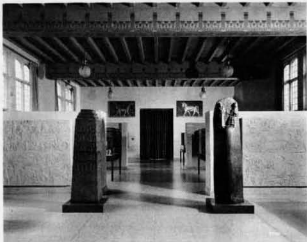
The Babylonian Hall forty-five years ago when the museum opened.