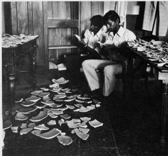
Two young Tamil architectural students from Jaffna, who assisted in the excavation and in marking the Chinese pottery.