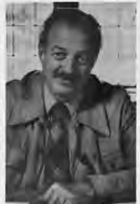
Robert McC. Adams