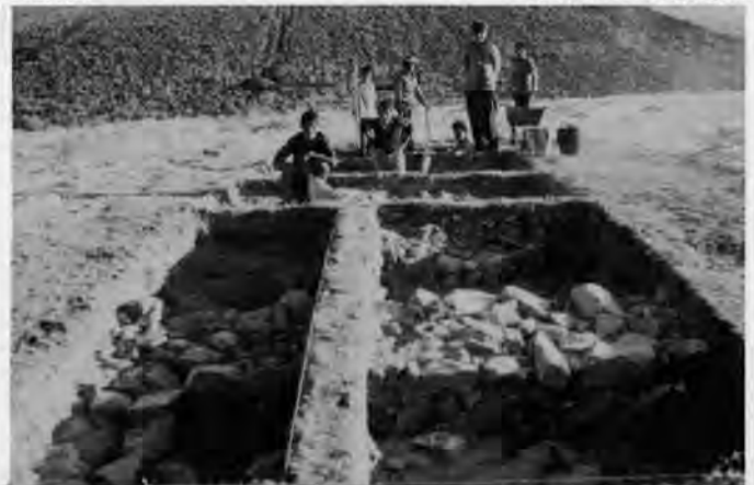
Kurban, view to north of step trench/workmen.