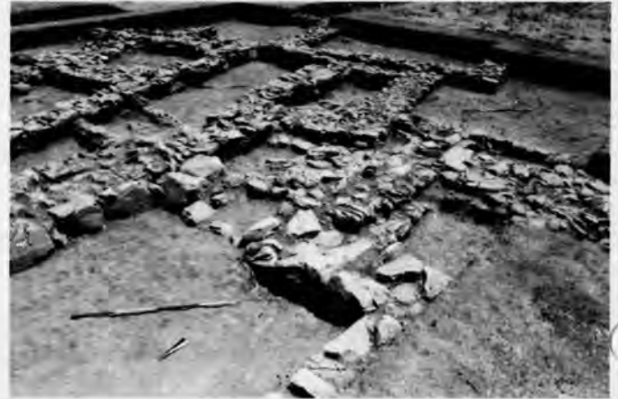
Entrance and rooms of final 3rd millennium occupation.

Mention of the Lower Euphrates salvage program—the international project organized by the Middle East Technical University under whose umbrella we are working—leads me to remark on the massive scale of the program and of the dams now under construction. Eight of the excavations are substantially north of us, in Malatya and Elazig provinces. There