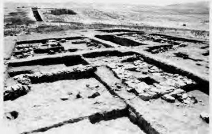
View of middle 3rd millennium level on small mound, with large mound step trench in background.