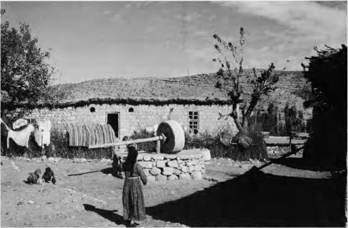
Stone wheel traditionally used for grinding flour. It is pulled around the pivot by donkeys or oxen when in use.