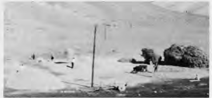
Tribulum being used for threshing.