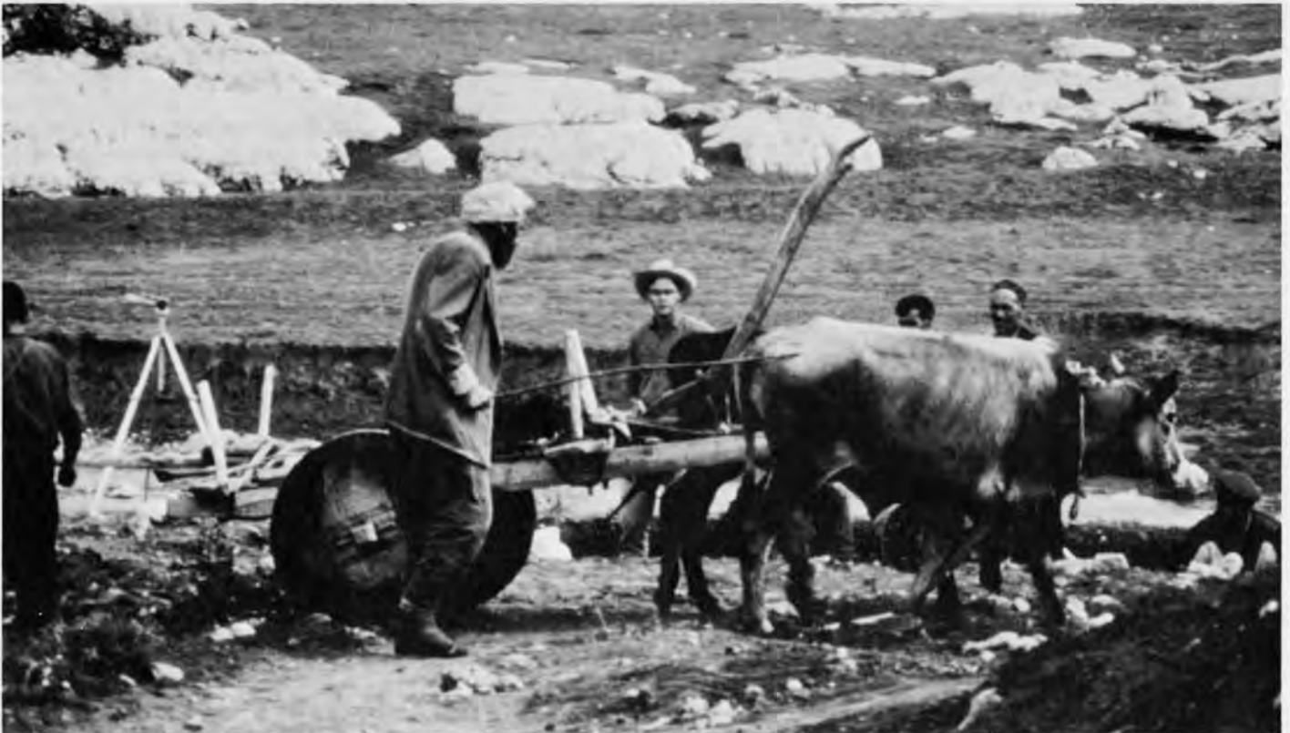
Wooden-wheeled Anatolian cart.