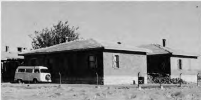
Prehistoric Project's excavation house at Çayönü.